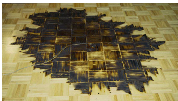
Figure 2 Burning in the cracks of an oak parquet floor.

showing both the area from which the sample was removed and the sample inside the container.