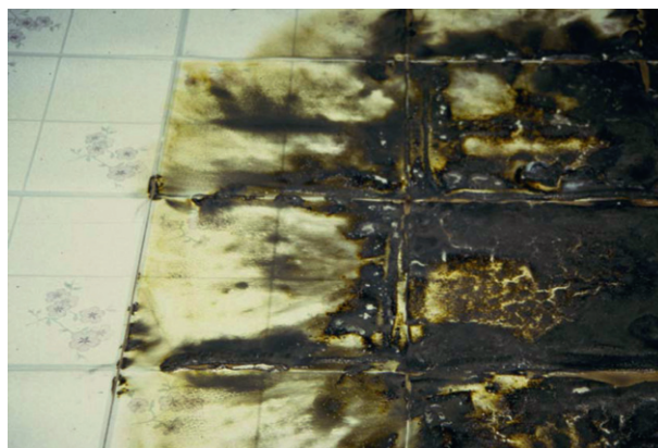
Figure 3 Burning in the cracks of a vinyl floor.